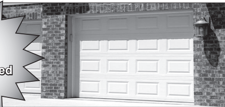
SALE DOOR 8x7 NJ Cert #13VH01882000