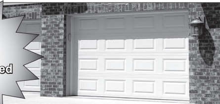
SALE DOOR 8x7 NJ Cert #13VH01882000