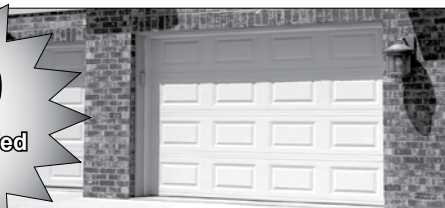
SALE DOOR 8x7 NJ Cert #13VH01882000

ONLY $699 Insulated Installed regularly $849