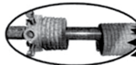
Broken Springs Specialist

Broken Springs Replaced • Rollers & Cables Replaced Transmitters & Receivers