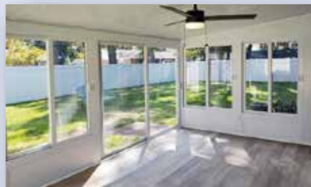
SUNROOMS & SCREEN PATIOS

SERVICES WE OFFER: 3 SEASON ROOMS/SUNROOMS BATHROOM RENOVATIONS KITCHEN RENOVATIONS